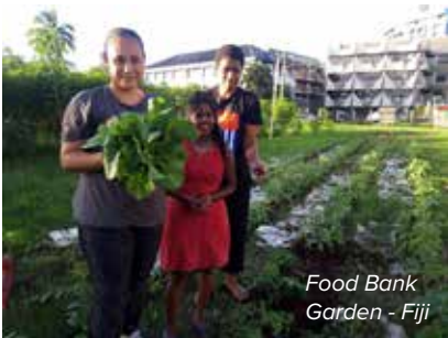
Food Bank Garden - Fiji

In Fiji - For other CWS partners food has been the main concern. In Fiji, featured in last year's Christmas Appeal, the collapse of tourism has left around 50 percent of the population unemployed.