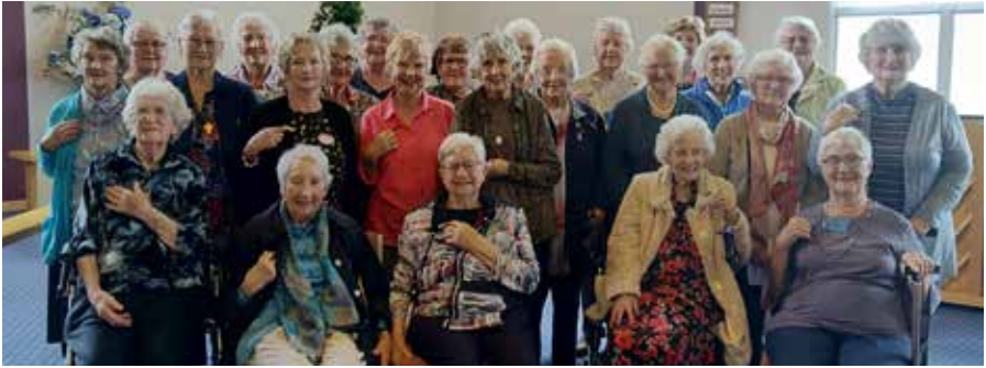
50-year award recipients at St Paul's, Paraparaumu.

of the AAW 50-year badges to 29 women from the southern region of the Wellington Diocese (Photo above).