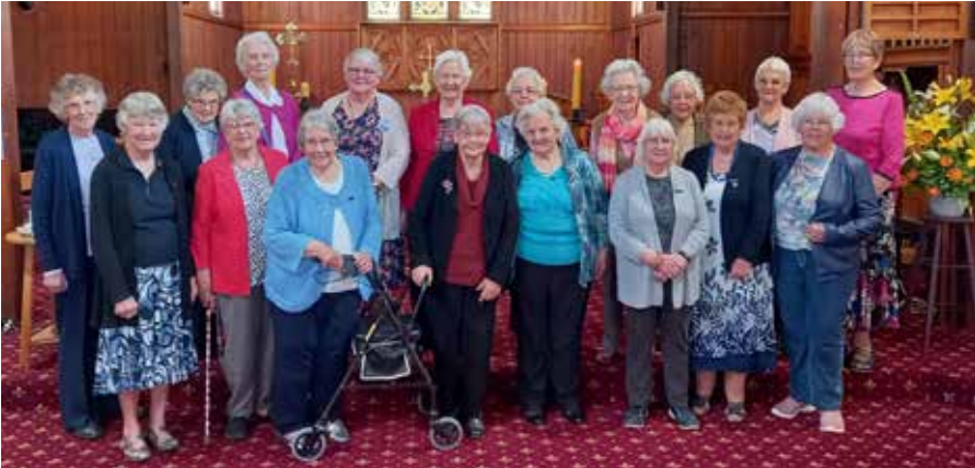
50-year award recipients at St John's, Feilding.

Paraparumu/Feilding: There were two Wellington Diocese Advent celebrations, one held in the north of the region and the other in the south.